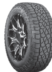
Courser® Trail HD™