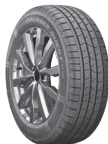
Courser® Quest Plus™